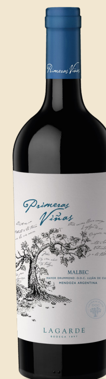
▼ MALBEC D.O.C. MAYOR DRUMMOND