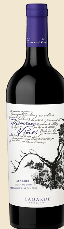
▼ MALBEC MAYOR DRUMMOND PERDRIEL (VINEYARDS ALTITUDE 850-950 MASL)

Their production takes between 14 and 16 months in French oak barrels, with at least 12 months of storage in a controlled environment, resulting in great potential that can be enjoyed for 10-15 years. Only limited quantities are produced each harvest.