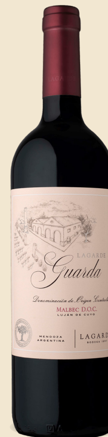
▼ MALBEC D.O.C.

GUARDA Colección de Viñedos is a release of wines inspired by each unique vineyard and their personalities. Mayor Drummond for our historical Malbec, Perdriel for its wonderful complexity and luscious Cabernet Francs and Gualtallary for the cutting edge present and future of mouthwatering Chardonnays.