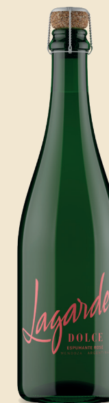
LAGARDE DOLCE ROSÉ