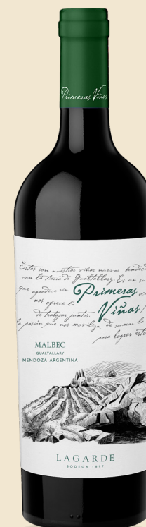
▼ MALBEC GUALTALLARY (VINEYARDS ALTITUDE 1350 MASL)