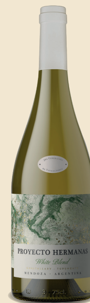
WHITE BLEND (WHITE GRAPES BLEND THAT CHANGES EVERY YEAR)