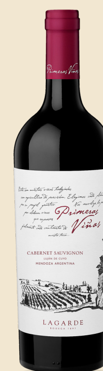
▼ CABERNET SAUVIGNON PERDRIEL (VINEYARDS ALTITUDE 950 MASL)