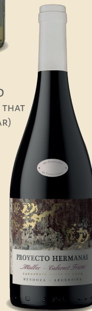
75% MALBEC 25% CABERNET FRANC

PROYECTO HERMANAS Pinot Noir ALTALLARY • TUPUNGATO DOZA • ARGENTINA