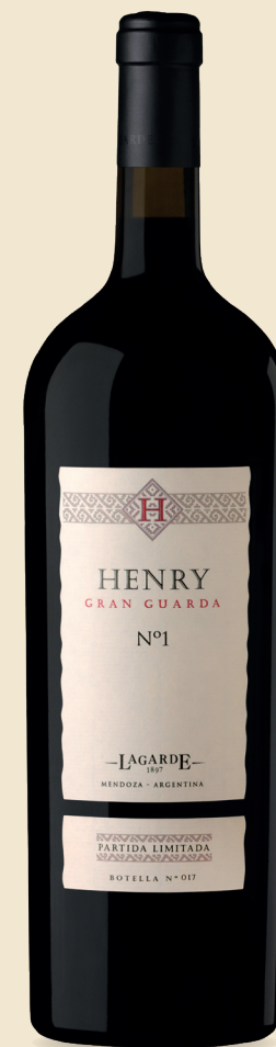
▼ HENRY GRAN GUARDA N°1

Our wines originate from grapes of low yield vineyards, with a long maceration time and at least a three-year aging period. It has been regarded as one of the highlights of Argentine red wines and is already a classic in the Argentine wine history.