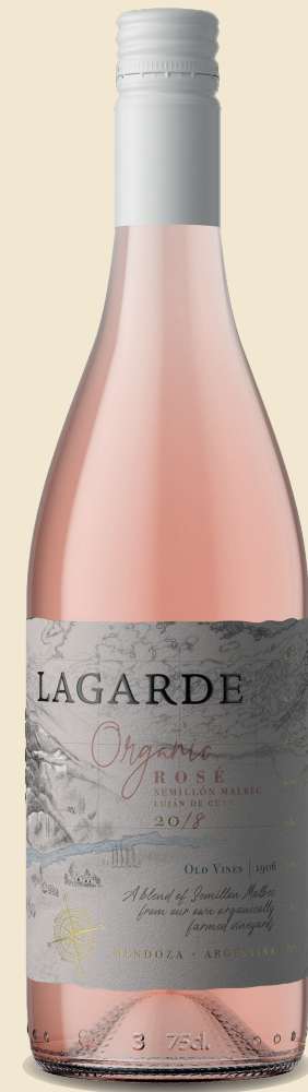
▼ ROSÉ (90% SEMILLÓN - 10% MALBEC)