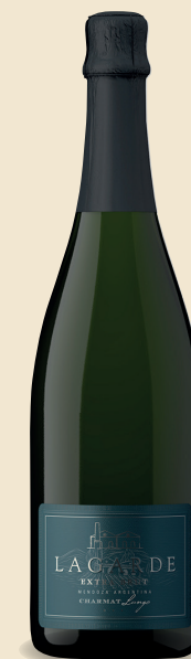
LAGARDE CHARMAT LUNGO EXTRA BRUT