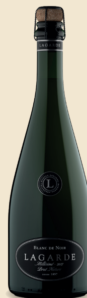
LAGARDE BLANC DE NOIR BRUT NATURE MILLÉSIMÉ