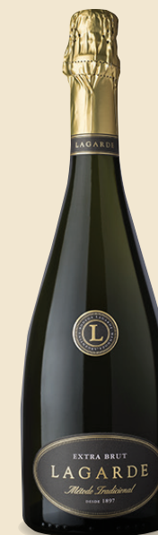
LAGARDE CHAMPENOISE EXTRA BRUT BLEND